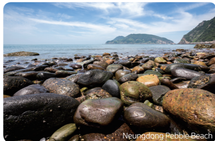
Neungdong Pebble Beach

Deokjeokdo Island offers various activities such as trekking, fun on the beach, and sea fishing, as well as convenient facilities including accommodation and rental car services. Many people visit this tourist recreation area as it takes only about an hour from Yeonan Pier Ferry Terminal.