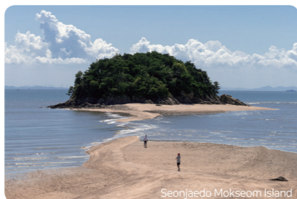
Seonjaedo Mokseom Island

You can go to these islands without taking a boat because they are connected by bridge. If you are looking for a casual island trip, this is your best option. You can also enjoy the wide-open seas and enjoy a dish of fresh raw fish by car.