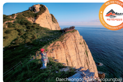
Daecheongdo Island Seopungbaji

Geologic highlights of ancient mysteries spread throughout the island. The beautiful blue coastline spans as far as you can see. While trekking, you will catch yourself stopping captivated by the scenery.