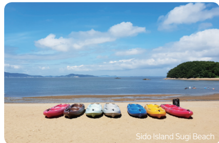
Sido Island Sugi Beach

It takes only 10 minutes from the Sammok Quay to reach three islands of Sindo, Sido, and Modo Islands. Many tourists ride bicycles here. In Jangbongdo island, you can enjoy camping, trekking, and wetlands experiences.